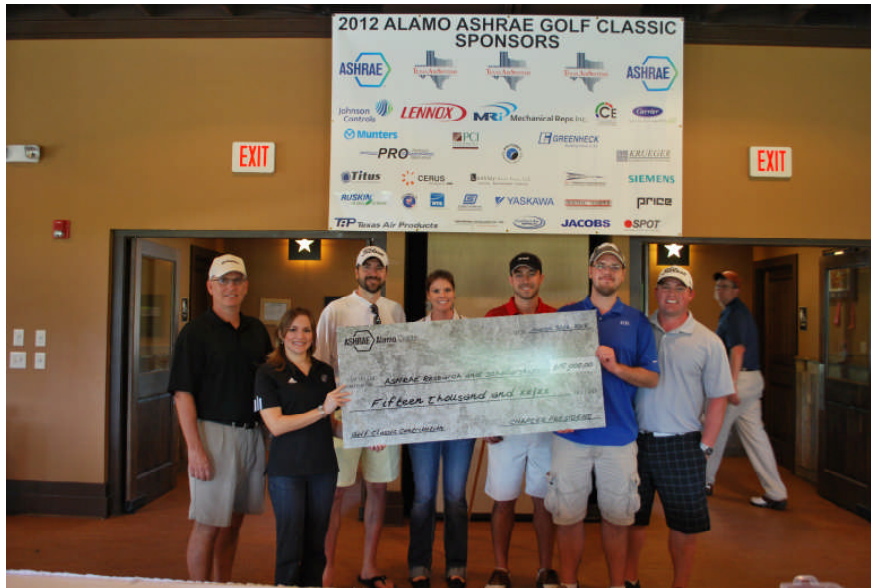
Board Of Governors holding the $15,000.00 ASHRAE Research check.