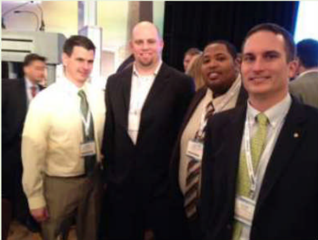
Leadership U participants at the Chicago Winter meeting.