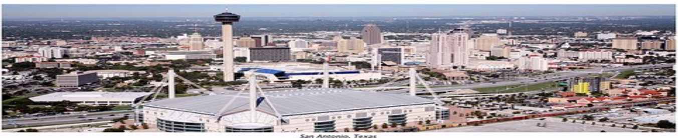
San Antonio, Texas