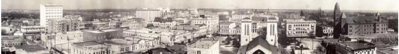
SAN ANTONIO, 1910